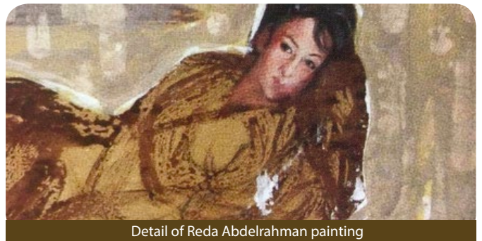
Detail of Reda Abdelrahman painting

Explore the art of oil painting and the qualities that make it unique. This studio art class is for the painter who wants to focus on the medium of oil paint. The instructor will introduce art terms and works with classical, romantic, and impressionistic qualities. Supply list available. Some supplemental supplies will be available.